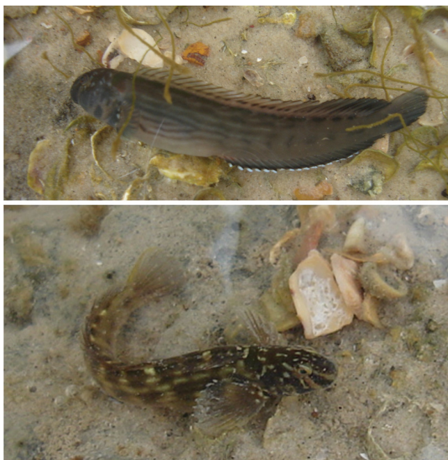
Fig. 1. Omobranchus punctatus in natural habitat (tide pools) in Brazil.

from the Caribbean entrance of the Panama Channel. Fish collections made between 1935 and 1937 at the Pacific side of the Channel (Miraflores locks) by Hildebrand (1939) yielded no specimens of O. punctatus . Also, the species was not recorded in these areas by McCosker & Dawson (1975). To date, there is no evidence of its occurrence on the Pacific coast of Panama. The Channel first began operation in 1914. The first record of O. punctatus in Trinidad dates from the 1930s. The first records of O. punctatus in Panama, at the Caribbean entrance to the canal, are from 1967, much later than the first record from Trinidad (1930) (Table 1). Springer & Gomon (1975) and Carlton (1985) suggested that it is likely that specimens of muzzled blenny from Panama originate via shipping movements from the population at Trinidad. This hypothesis was supported by strong similarities in the morphology of specimens collected from those two countries.